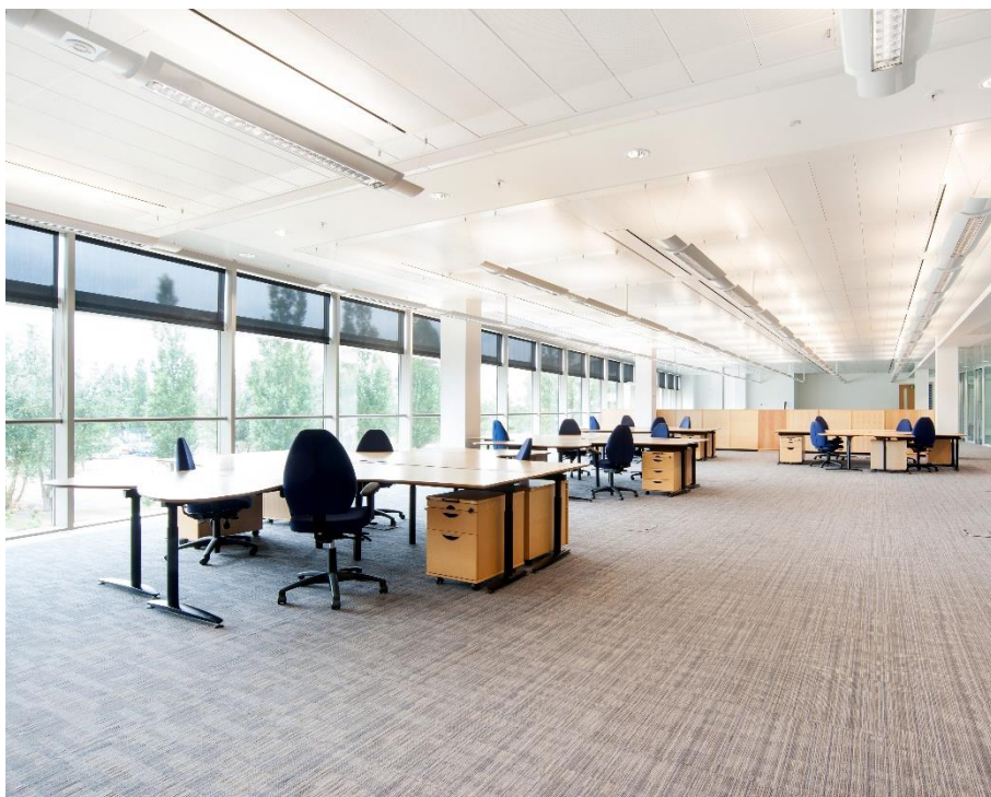
Example office suite, not actual space

GRADE A OFFICE SUITE ON BUSINESS PARK AVAILABLE TO RENT